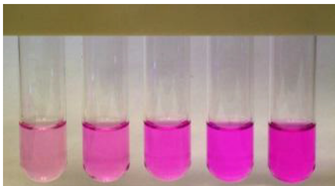
Figure 5. Purple coloured permanganate standard solutions, corresponding to the following \text{MnO}_4^- concentrations: 0.5, 1.0, 1.5, 2.0, 2.5 \times 10^{-4} \text{ mol L}^{-1} .