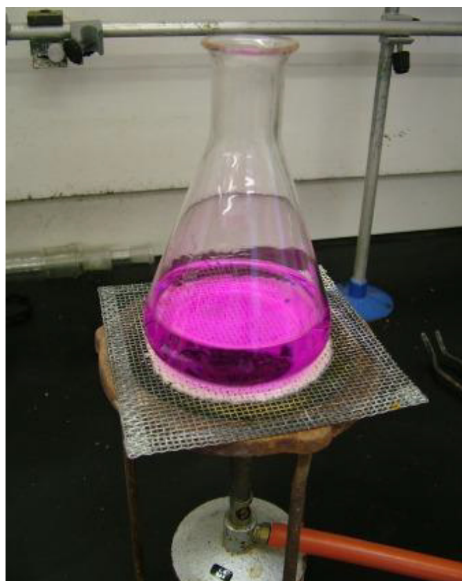
Figures 1 – 4. Development of purple colour due to formation of \text{MnO}_4^- in steel sample solution. Figure 1 shows the nearly colourless solution containing dissolved steel, before any oxidation of manganese has occurred. As the solution is heated over a period of about 20 minutes the purple colour of \text{MnO}_4^- gradually becomes stronger and stronger, as shown in Figures 2, 3 and 4.