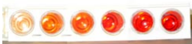
Figure 5. The same boiling tubes as in Figure 4 (prepared using \text{Fe}^{3+} standard solutions with concentrations of 2 - 12 \times 10^{-5} \text{ mol L}^{-1} ) viewed from above, looking directly down the length of the tube. This view provides the most accurate “eyeball” comparison of the solutions’ colour intensities.