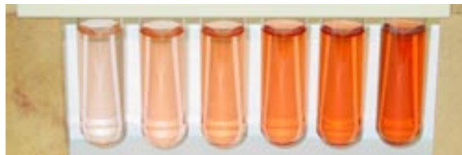
Figure 4. Blood-red coloured solutions produced by the ferric thiocyanate complex ion ( \text{Fe}[\text{SCN}]_2^+ ). These solutions were prepared using the following range of \text{Fe}^{3+} standards: 2, 4, 6, 8, 10, 12 \times 10^{-5} \text{ mol L}^{-1} .