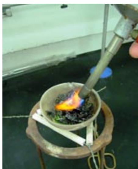
Figure 2. Set up used for combusting a silverbeet sample directly in the bunsen burner flame.