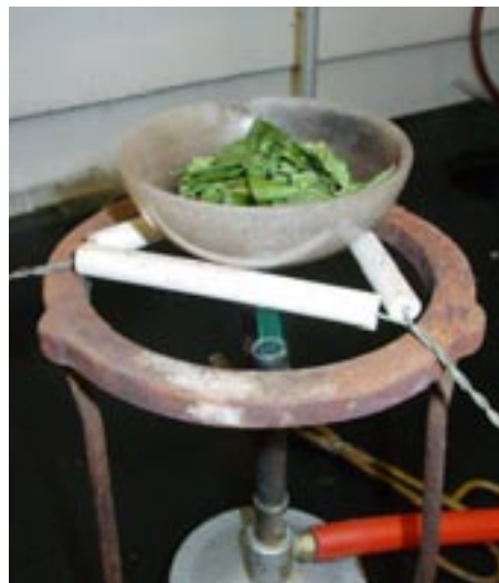
Figure 1. Set up used for heating a silverbeet sample in a crucible.