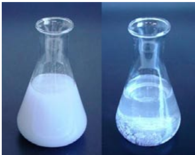
Figure 1: Left flask: a cloudy white precipitate of silver chloride forms upon addition of silver nitrate to the chloride sample solution. Right flask: the result of heating and standing. The silver chloride precipitate is seen to coagulate into large clumps, leaving a clear solution. NB: exposure to sunlight may result in some decomposition to form elemental silver, giving the precipitate a slight purple colour as seen here. Try to avoid exposing the precipitate to sunlight any longer than is absolutely necessary.

9. Carefully place the filter paper containing the precipitate on a watch glass and dry overnight. Weigh the dried filter paper and precipitate and calculate the weight of the dried precipitate using the known weight of the filter paper.