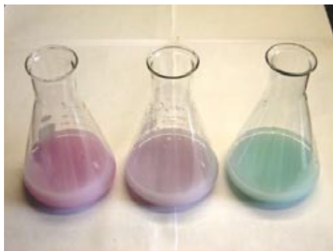
Figure 2 Same colour changes for calcium-EDTA titration as in Figure 1, but for cloudy (opaque) sample solution, eg milk. Left flask: pink/red colour well before endpoint. Centre flask: last trace of purple colour just before endpoint. Right flask: blue colour at endpoint.