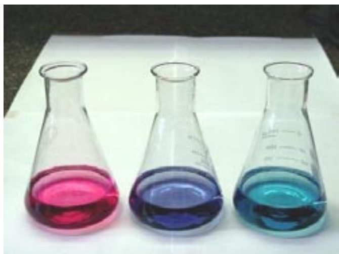
Figure 1 Colour changes for calcium-EDTA titration in clear sample solution using Patton-Reeder indicator. Left flask: pink/red colour well before endpoint (excess \text{Ca}^{2+} ions present to complex with indicator). Centre flask: last trace of purple colour just before endpoint ( \text{Ca}^{2+} ions almost all complexed by EDTA). Right flask: blue colour at endpoint (all \text{Ca}^{2+} ions complexed by EDTA, indicator completely uncomplexed).